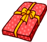
a box of