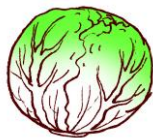
a head of